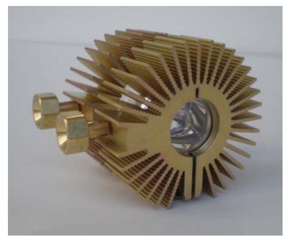
Figure 3 CL1571 Replacement Assembly for X7000