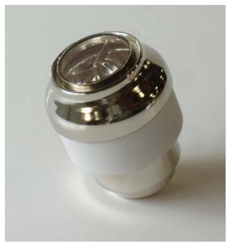
Figure 2 CL1495 Replacement Lamp for CL1567/X8000