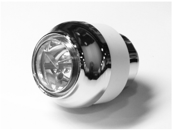
Figure 4 CL1492 Replacement Lamp for CL1571/X7000